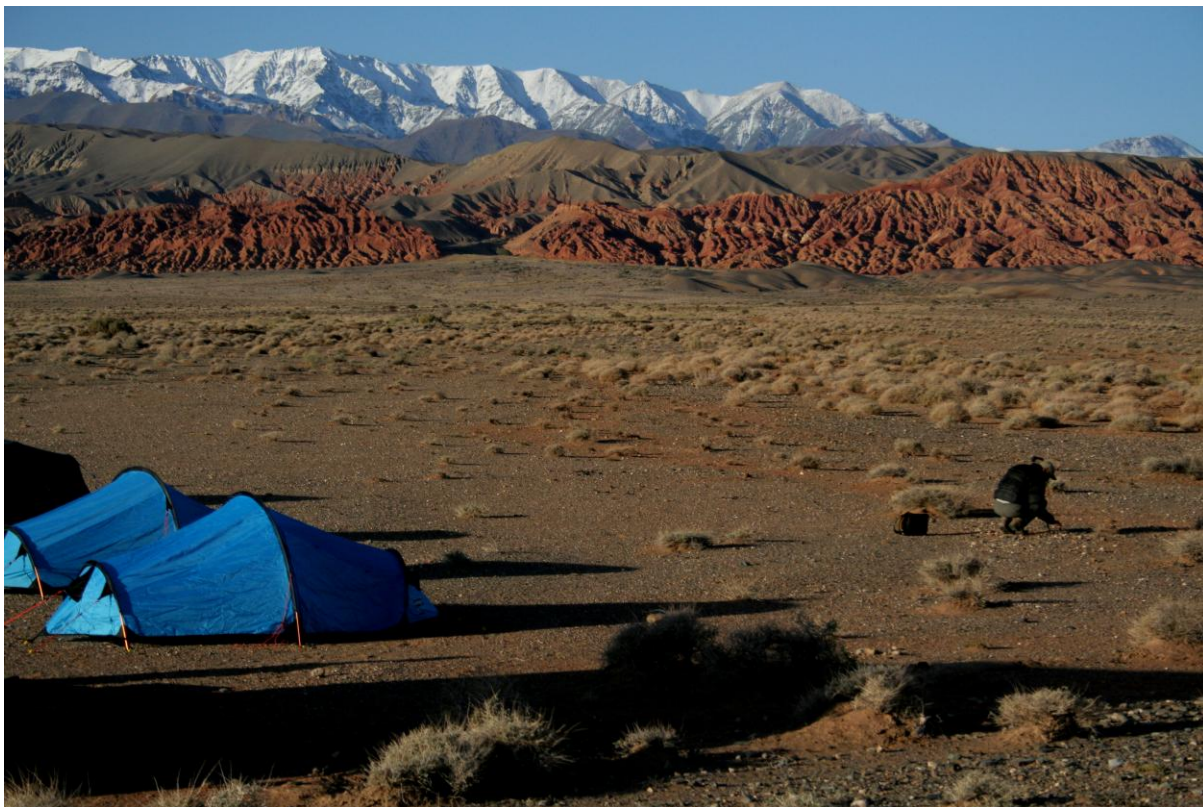
Mt Burhan Buudai, a sacred mountain for locals

Your flight takes you to the provincial centre of Altai where our local crew will welcome you. The highest elevated town of Mongolia (2,181m), Altai is a provincial centre of Gobi-Altai province. The area is famous for its writers, poets and politicians in Mongolia. You will continue the trip towards the curative sand spa with an en-route exploration of the ruin of the Biger Monastery. Enjoy the tranquility of the wilderness area in the rest of evening.