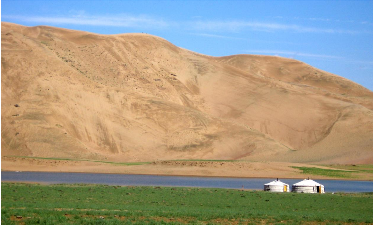
The Lake Ereen, surrounded by 'singing' dunes

You next adventure continues to the Lake Ereen, a stunning fresh water lake, surrounded by the large pyramid shaped singing sand dunes of the Mongol Els, which emits a humming sound upon its surface shifts. Local legend tells that a giant cow-like water creature lives in the lake and makes an appearance at the end of summer. Bar headed goose, Sand Owl, Kite, Sea gull and Buzzard is common here.