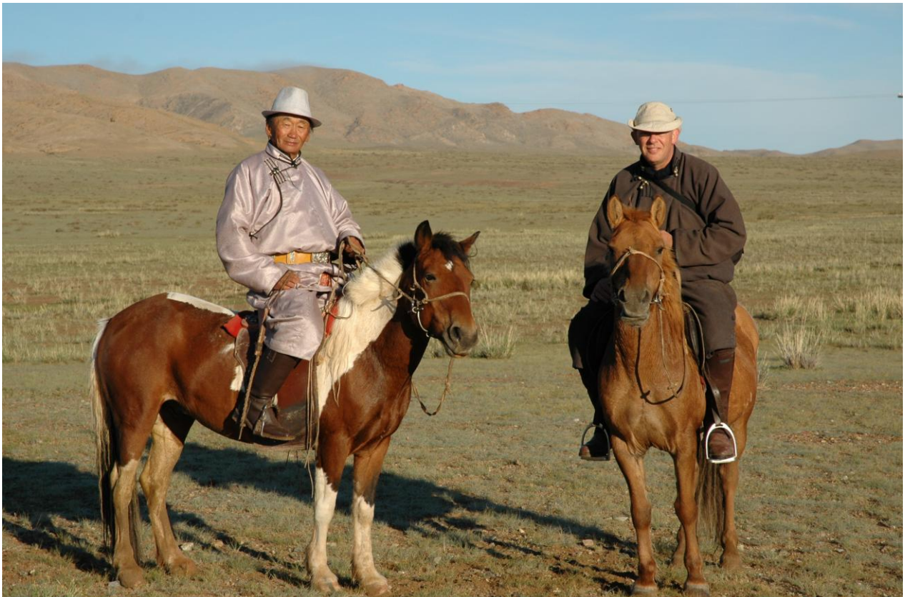
Horse man in Western Mongolia-Horse culture is essence of nomadic living

You will visit a horse herding nomadic family and ride around their campsite. Here you can experience Mongolian nomads' daily animal husbandry chores of catching horses, herding and watering animals. You can also experiment how to distil 'milk vodka' from fermented milk. If you