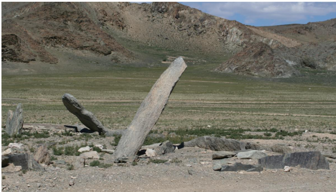
Burial ground from Hunnu period at the edge of Gobi Desert

See beautiful Tsagaan Haalga waterfall in the morning. After lunch, we travel through drive across Mongol Altai mountain range via a district of Tsogt with en-route stop at the burial sites of Hunnu period (BC 3C –AD 1C). The landscape will switch into dry gobi area later today. You will go camping with view of a stunning monolith of Mother Mountain.